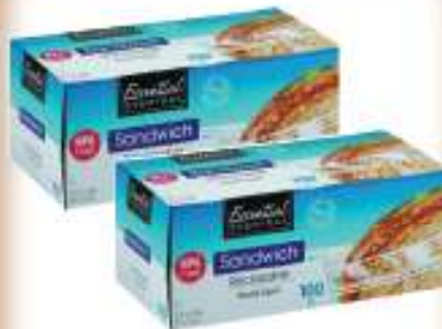
Essential Everyday Sandwich Bags Reclosable 100 Count