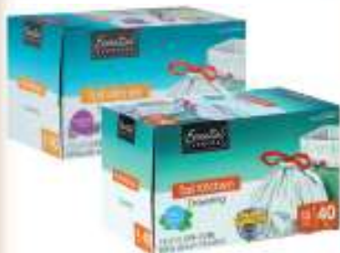
Essential Everyday Tail Kitchen Bags Fresh or Lavender Scent 13 Gallon, 40 Count