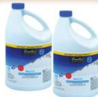
Essential Everyday Bleach 121 oz.