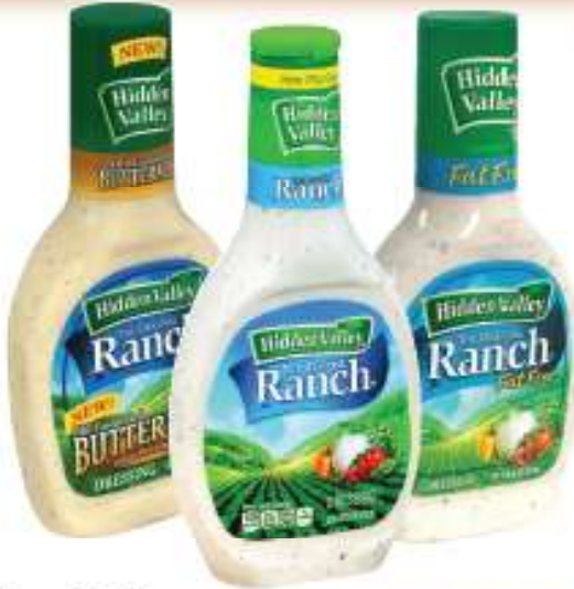
Hidden Valley Ranch Dressing Selected Varieties 16 oz.

Monday - Saturday 6:30 a.m. - 9:00 p.m. and Sunday 7:00 a.m. - 9:00 p.m.