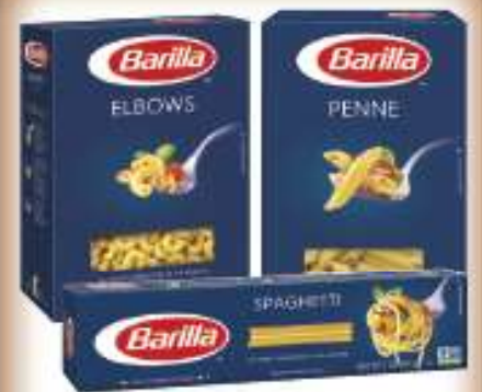
Barilla Pasta Selected Varieties 16 oz.