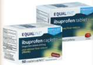
Equaline Ibuprofen Caplets or Tablets 50 Count