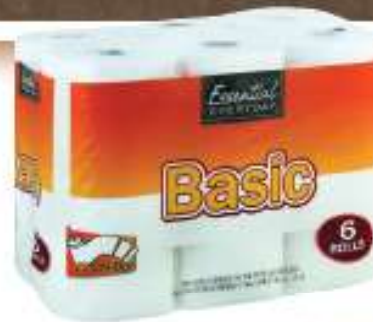
Essential Everyday Basic Paper Towels 6 Rolls