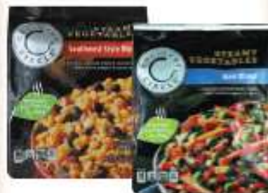
Culinary Circle Steamy Vegetables Selected Varieties 10 oz.