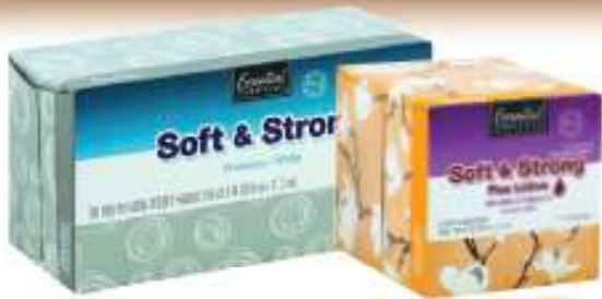
Essential Everyday Facial Tissue Selected Varieties 75 to 160 Count