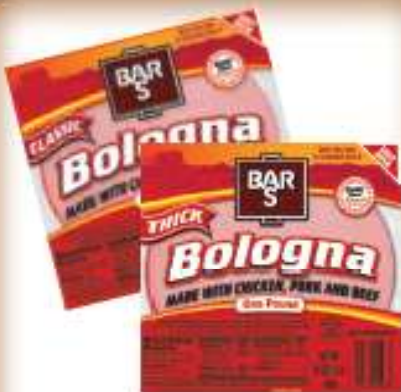
Bar-S Bologna Classic or Thick Cut 16 oz.