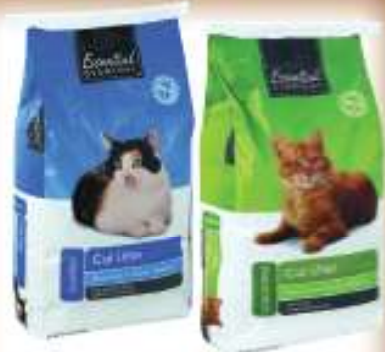
Essential Everyday Cat Litter Scented or Unscented 10 lb.