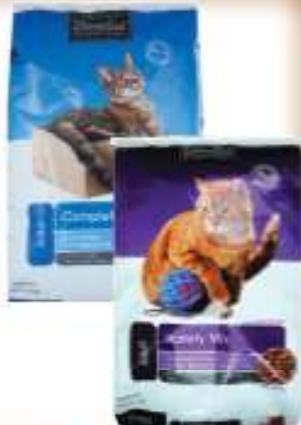
Essential Everyday Cat Food Selected Varieties 16 lb.