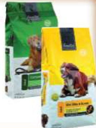
Essential Everyday Dog Food Complete Nutrition or Mini Bites and Bones 4 lb.