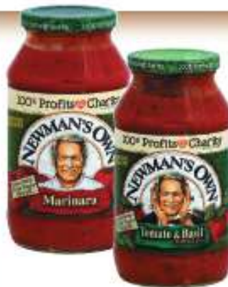
Newman's Own Pasta Sauce Selected Varieties 15 to 24 oz.