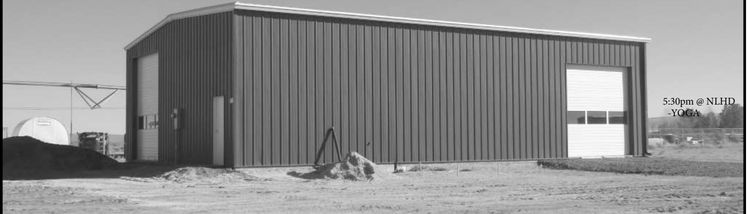
5:30pm @ NLHD -YOGA

New facility under construction in the heart of Christmas Valley. 87210 Christmas Valley Hwy (just WEST of J.W. Kerns)