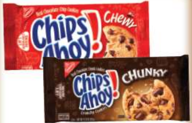
Nabisco Chips Ahoy Cookies Selected Varieties 7 to 13 oz.